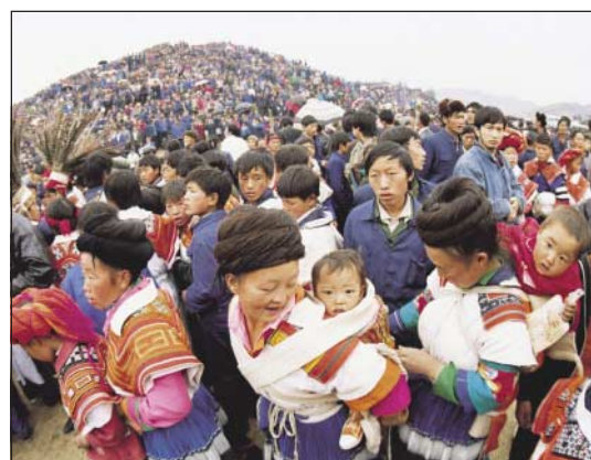
Social support after childbirth is linked with low rates of postpartum depression

We have provided some examples at different levels of the pathway to care and prevention of mental illness where the developed world could learn from the developing world. High income countries considering such developments would have to make them fit for purpose in a different social and economic environment. The issue of sustainability also arises. Community based support after childbirth has a long history, and medical ward care for psychiatric emergencies in Jamaica has been used for 30 years, but